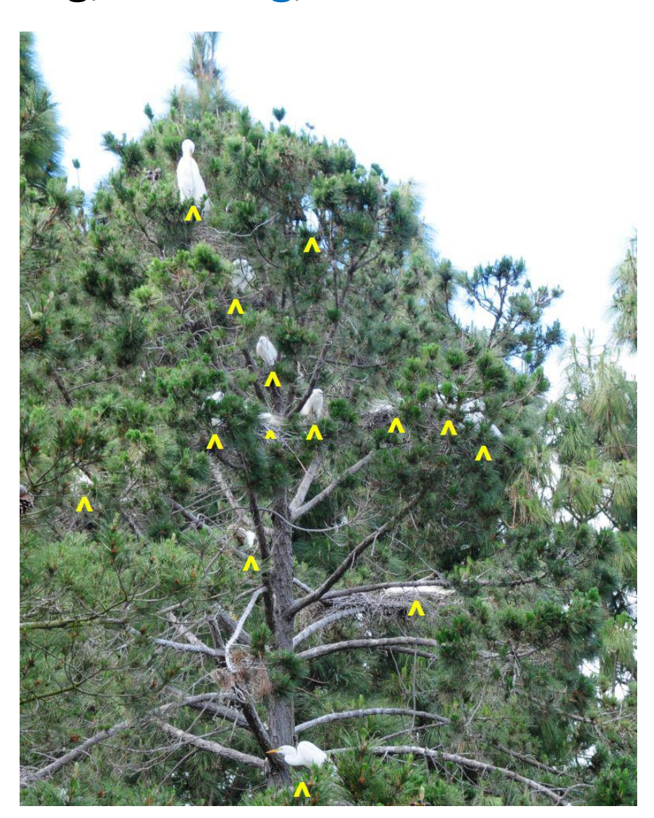
Stage 0 - Pre-nesting: birds at or near colony, courtship, mating, roosting, nest construction.